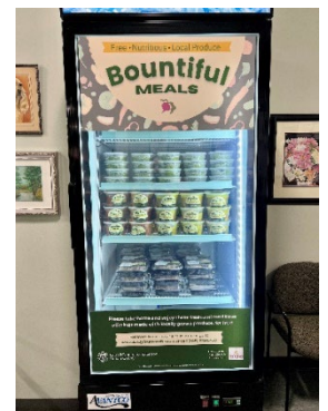
Bountiful Meals freezer in Putnam Valley Senior Center

Cornell University Cooperative Extension provides equal program and employment opportunities. Please contact our office if you have any special needs.